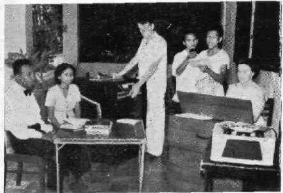
The Radio Group at Work

The preparation and recording of Gospel programs to broadcast over the Far East Broadcasting Station in Manila has been a great joy and we love the work. Three years ago, when the mission purchased a recorder to start this work, we had no trained talent. There were many trying circumstances as we began to build up programs with Bible School students. Then young Christians from Phnom Penh agreed to train with us for musical numbers and we were much encouraged. These two groups are continually improving in singing and in instrumental numbers as well.