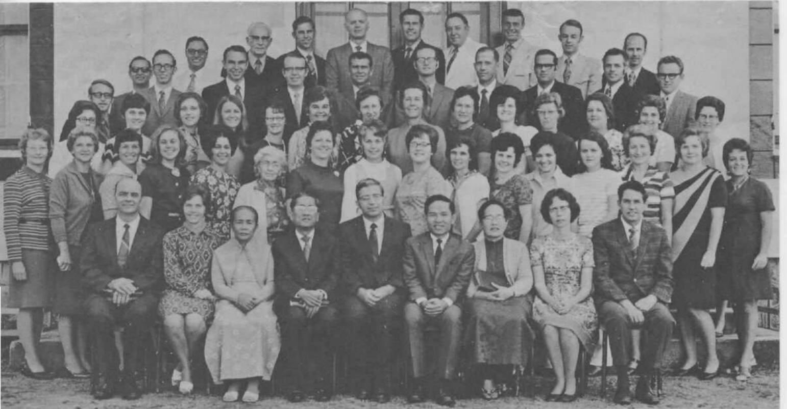
VIETNAM MISSIONARIES, DALAT, 1972