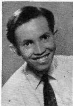
Recently saved in Chi-Hoa Prison

PUBLICATION. At least five million pages of Gospel literature have been prepared and printed during the past year from special funds received from Home.