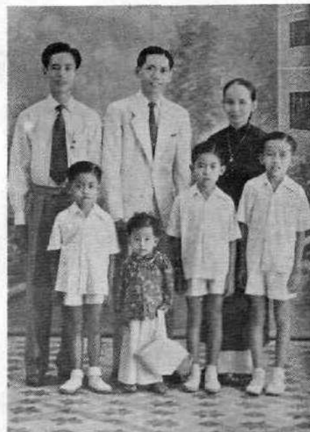
The Go-Cong pastor and family