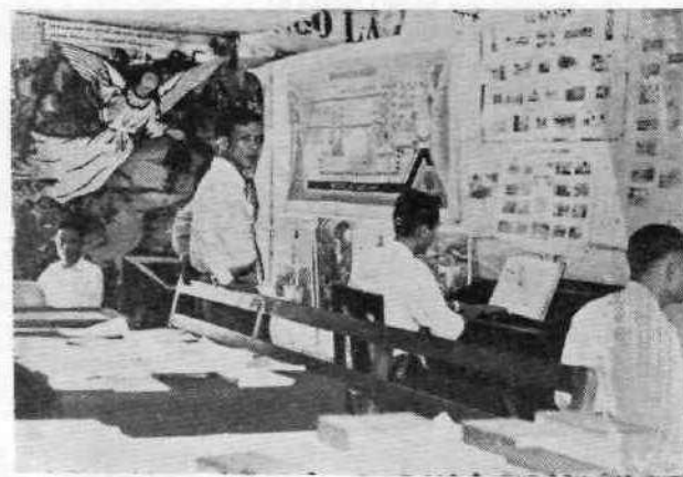
Reading booth at Tam-Ky fair

Since last conference the Dalat Gospel Press has ceased to exist and is now the Gospel Press of Saigon. The closing of the Press in Dalat involved the sale of the large press and most of the type. We are thankful to God for providing a buyer for this. The cash sales of the Press, since moving to Saigon, have increased over 300 percent.