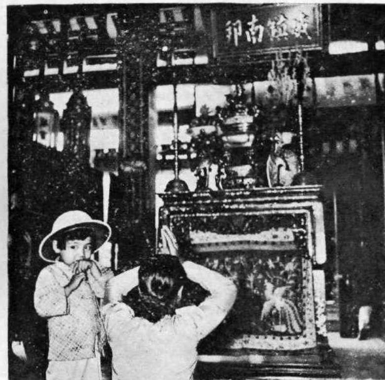
Ancestor Worship at Tet Time (see page 2)

THE VIET-NAM MISSION of the CHRISTIAN AND MISSIONARY ALLIANCE