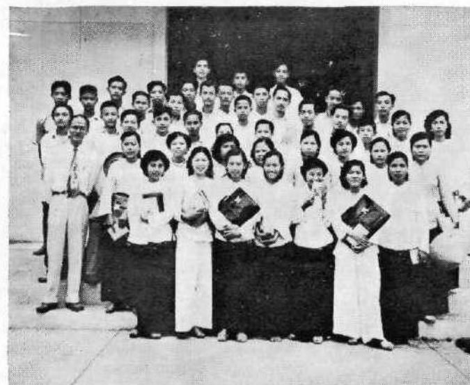
« Some of the High School Students Who Have Prayed »

Just after Christmas in a special youth rally, eight of these young people prayed. The following Saturday morning when I asked the eight to stay after class, almost the entire class remained and many more wanted to pray. In order to ascertain the ones who were really seeking God, we told all those who wanted to pray to go down to the church. To our great surprise and joy, over 40 more prayed.