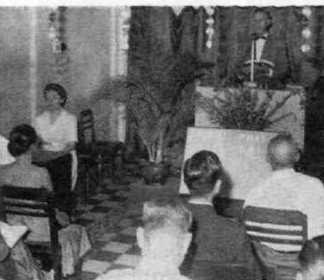
Opening a new street chapel