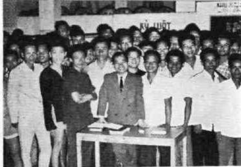
. . . with converts