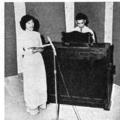
Broadcasting Gospel Music

J UST seven years ago the Gospel radio and recording ministry in Viet Nam was in its infancy. At that time there were three fifteen-minute daily programs through Far East Broadcasting Company facilities in Manila and a half-hour weekly program over a local station. Today, free radio time and public address broadcasts total 21 hours weekly. This is truly a mighty voice, preaching the Gospel on six local radio stations covering nearly all of free Viet Nam in addition to the short wave stations at Manila beamed into both north and south Viet Nam.