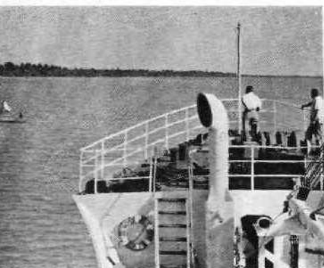
Up the Saigon River