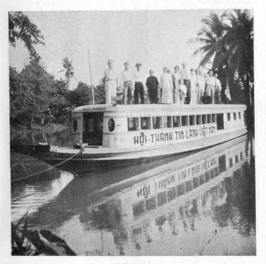
The Gospel Boat (see page 4)

THE VIET-NAM MISSION of the CHRISTIAN AND MISSIONARY ALLIANCE