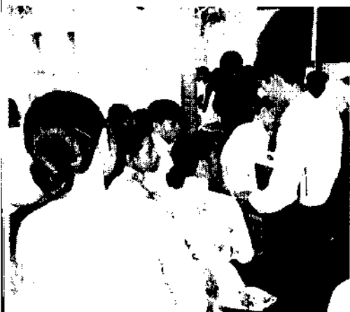
earnest study and enthusiastic witness