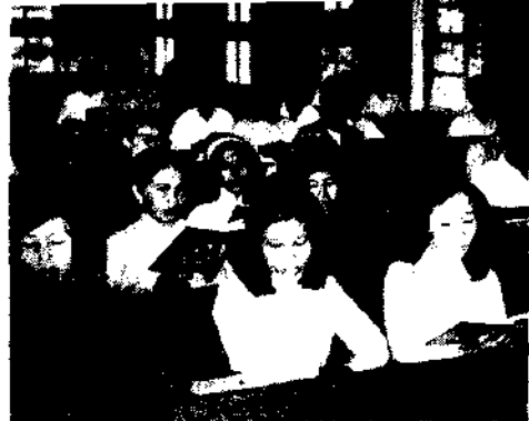
Despite the draft, rationing and crying babies...