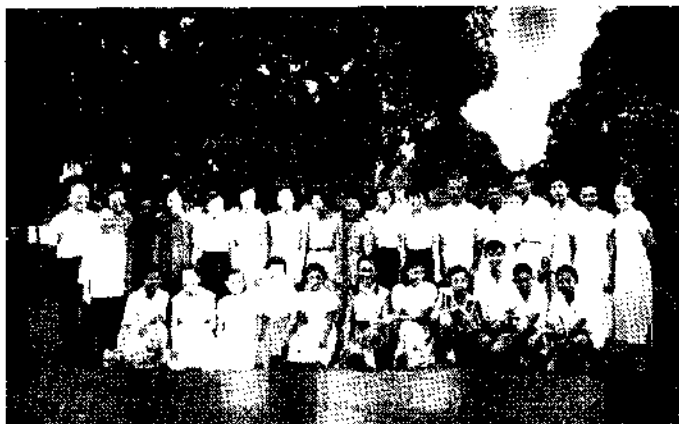
25 chinese christians baptized at Phnom-Penh

a banner day, as twenty-five followed the Lord in the rite of baptism, most of them young people. Pray that they shall be bold witnesses to influence others to renounce that which is vain, and enter into vital relationship with the Lord Jesus Christ. Pray too for the many, many Chinese who live in this country and who are hungry for the Bread of Life.