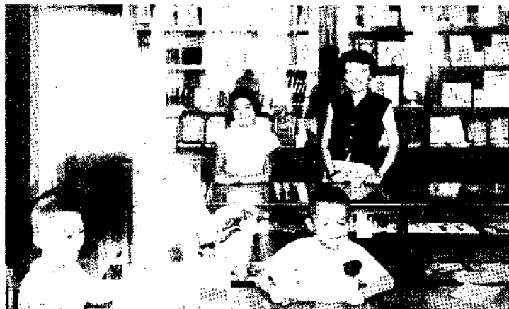
Inside of new Book Room.