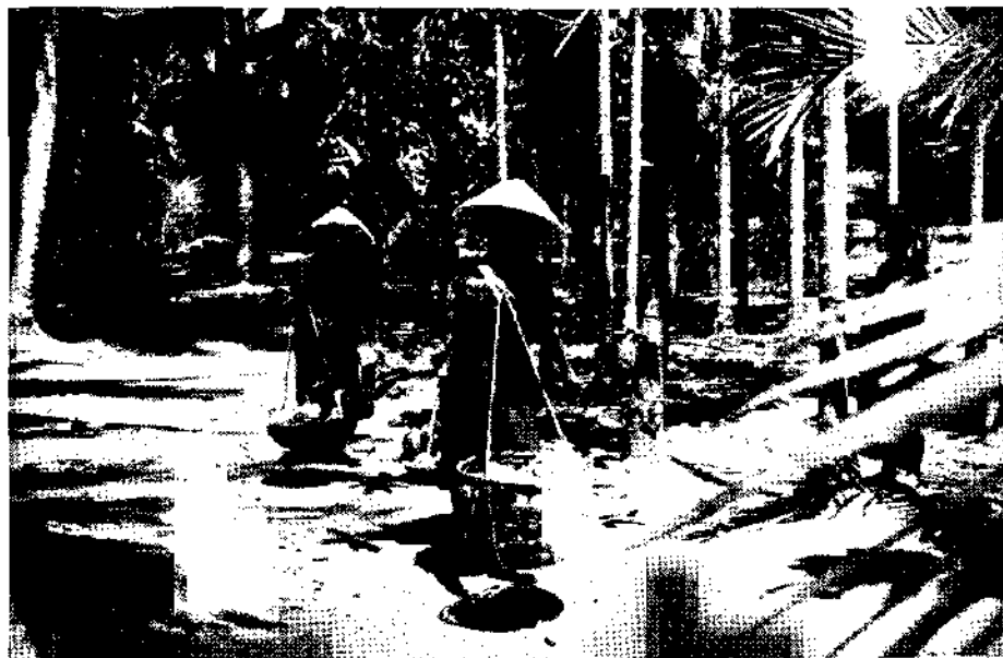
Vietnamese Women Returning From Market