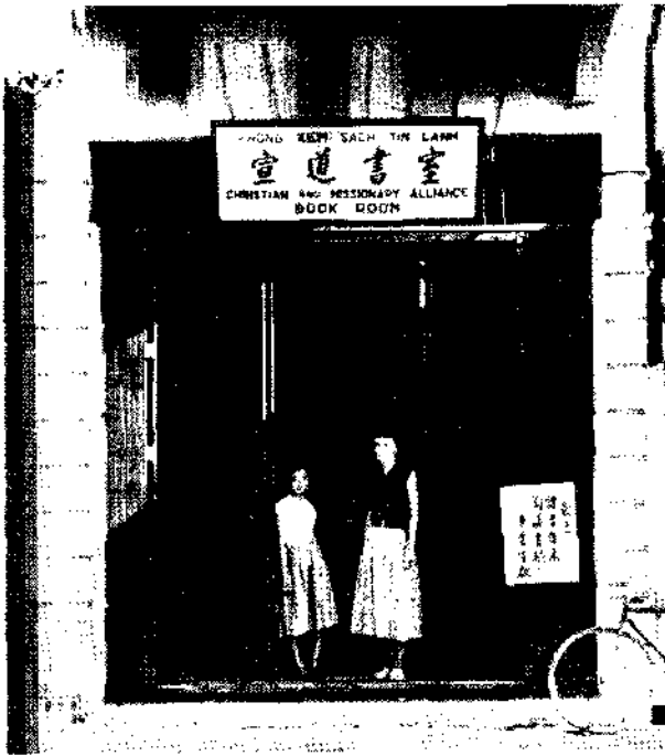
Chinese Book Room in Cholon