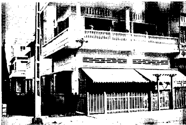
Saigon Gospel Press and Residence