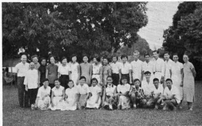
25 chinese christians baptized at Phnom-Penh

a banner day, as twenty-five followed the Lord in the rite of baptism, most of them young people. Pray that they shall be bold witnesses to influence others to renounce that which is vain, and enter into vital relationship with the Lord Jesus Christ. Pray too for the many, many Chinese who live in this country and who are hungry for the Bread of Life.