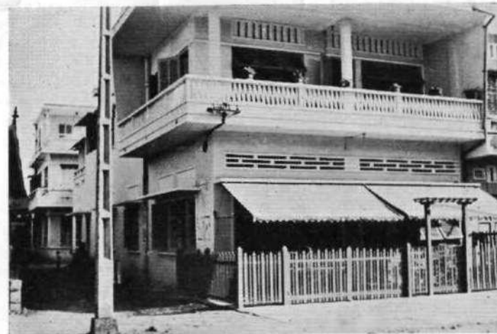
Saigon Gospel Press and Residence