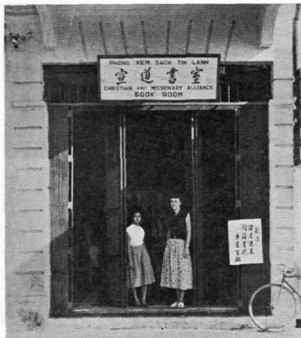
Chinese Book Room in Cholon