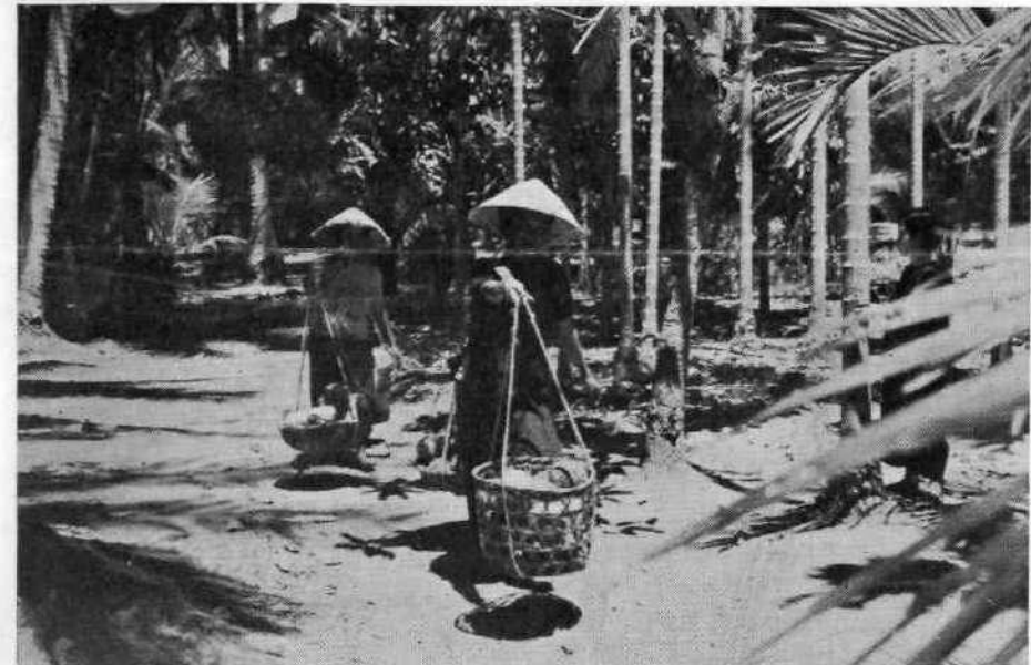
Vietnamese Women Returning From Market