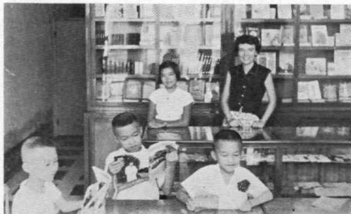
Inside of new Book Room.