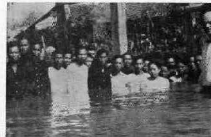
Baptism at Ba-Tri

The church at Ba-tri, for years beset by poverty and the political unrest in that area, has recently begun to show unusual progress and blessing. Thirty-four of those who found the Lord during the past year are being baptized here.