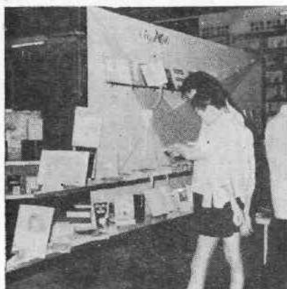
Gospel Literature on display

T HOUSANDS of Vietnamese viewing the six day book fair held in Saigon passed a prominent section with this sign, «Sach Tin Lanh» or, «Gospel