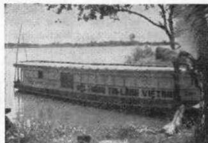
The Gospel Boat

There are many invitations for them to come and preach. Recently, one village which had already been visited once sent a delegation of two to plead for a series of meetings from the Gospel Boat, stating that forty or fifty were ready to pray if