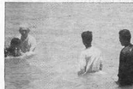
Qui-Nhon Baptismal Service

The church at Ba-tri, for years beset by poverty and the political unrest in that area, has recently begun to show unusual progress and blessing. Thirty-four of those who found the Lord during the past year are being baptized here.